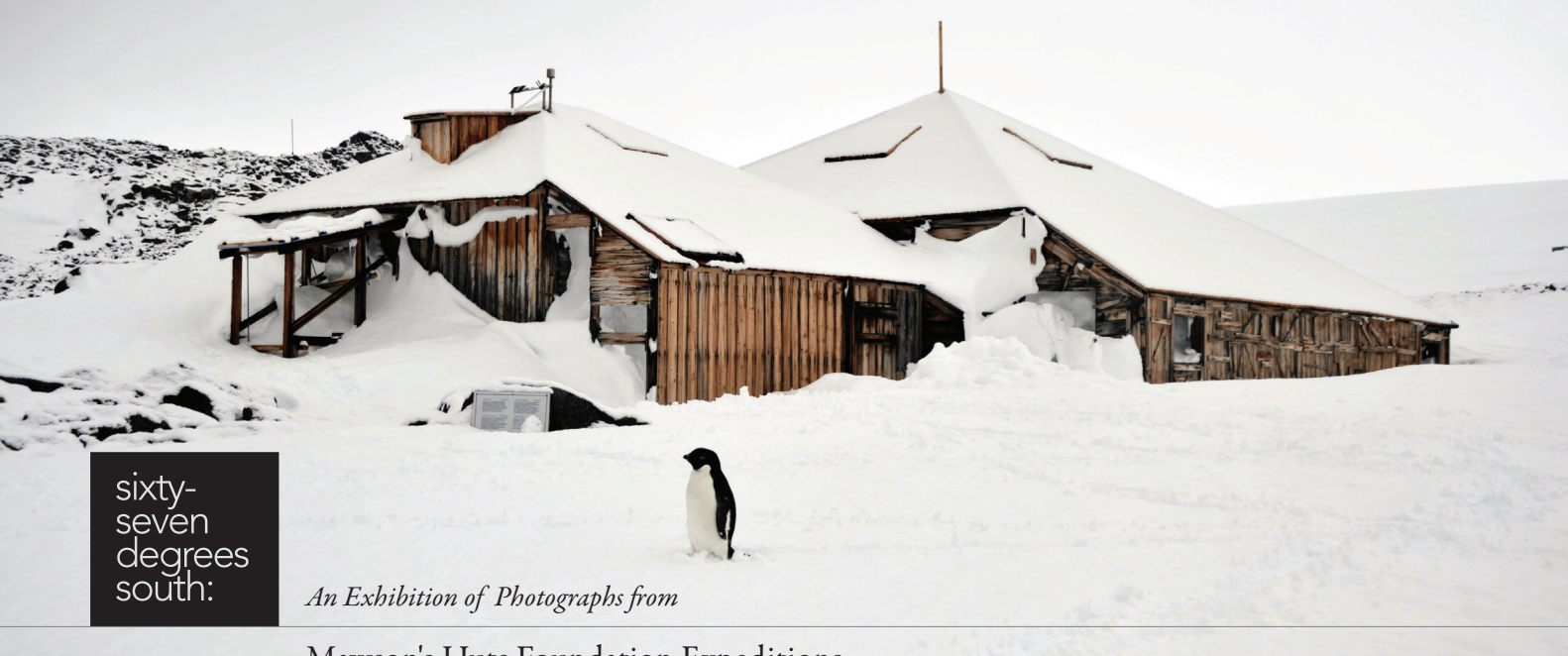
Mawson's Huts Foundation Expeditions